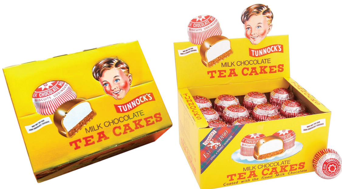
Packaging display box