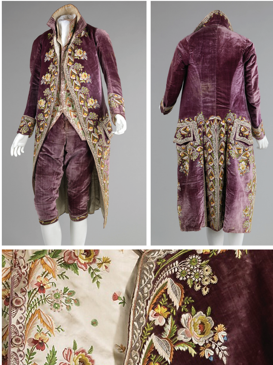
French court suit (c. 1810)

Silk velvet with silk thread embroidered detail (suit worn at state occasions during the time of Emperor Napoleon Bonaparte)