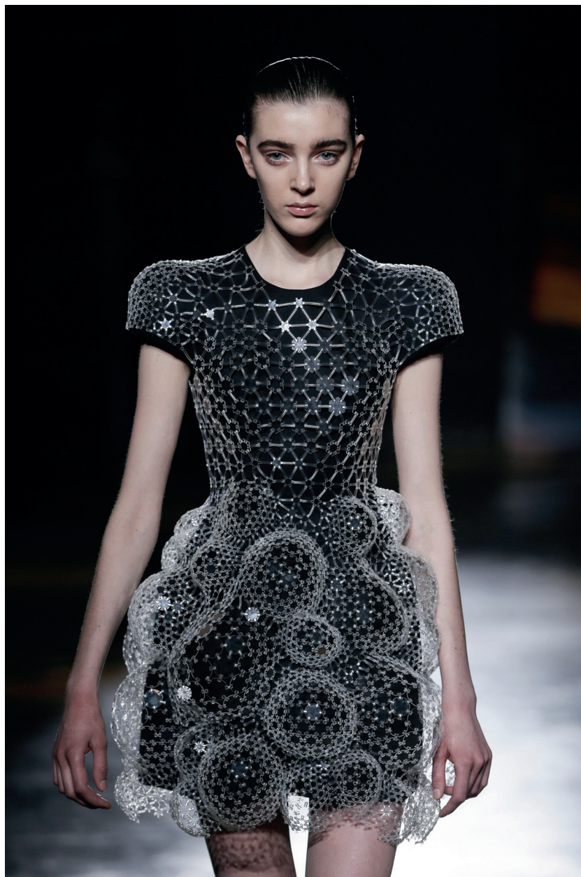
Lucid A/W Collection (2016) by Iris Van Herpen

Materials: lasercut transparent elements, flexible tubing