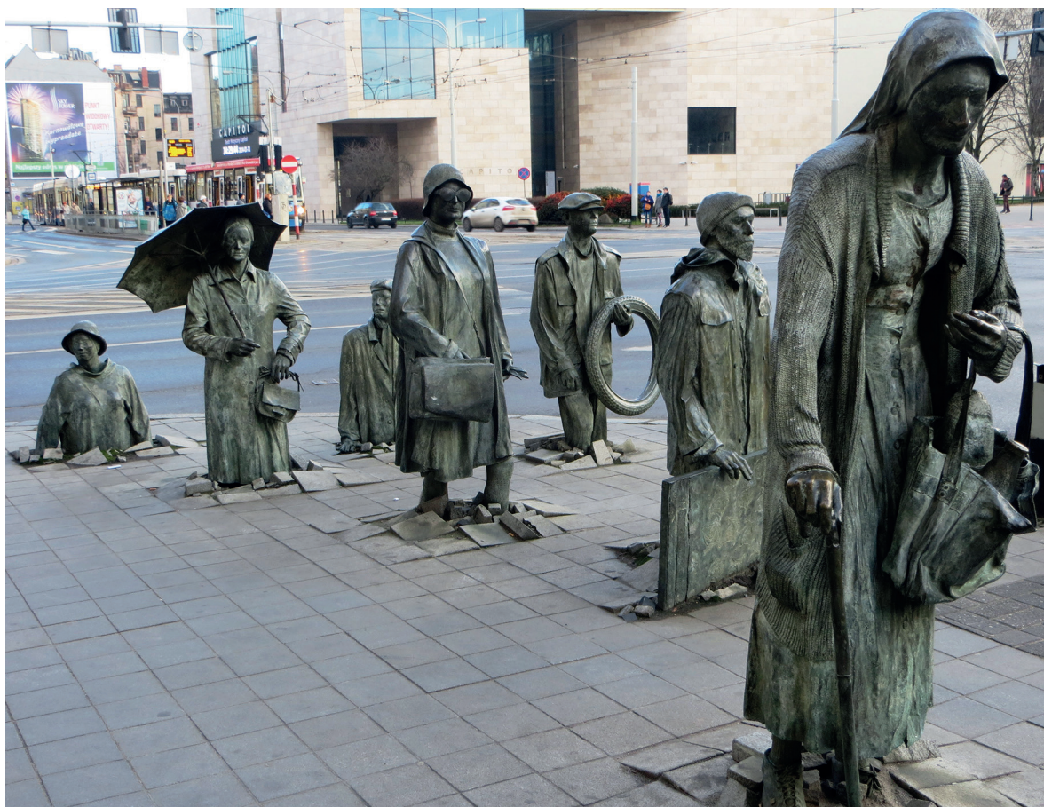
The Anonymous Pedestrians (2005) by Jerzy Kalina Bronze cast figures (life-size), Wrocław Poland

6. Analyse the following elements of this sculptural work