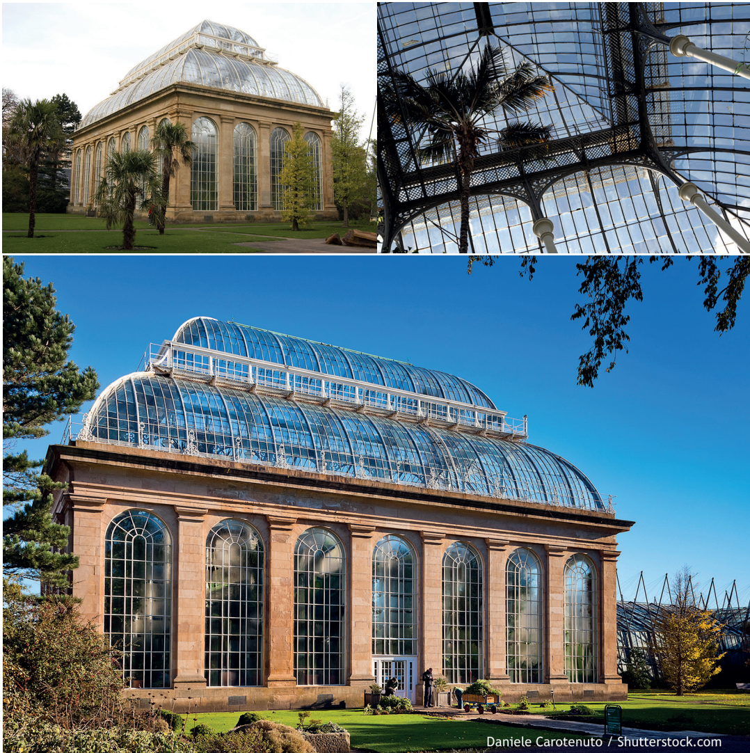
Tropical Palm House (1858) Edinburgh Royal Botanical Gardens