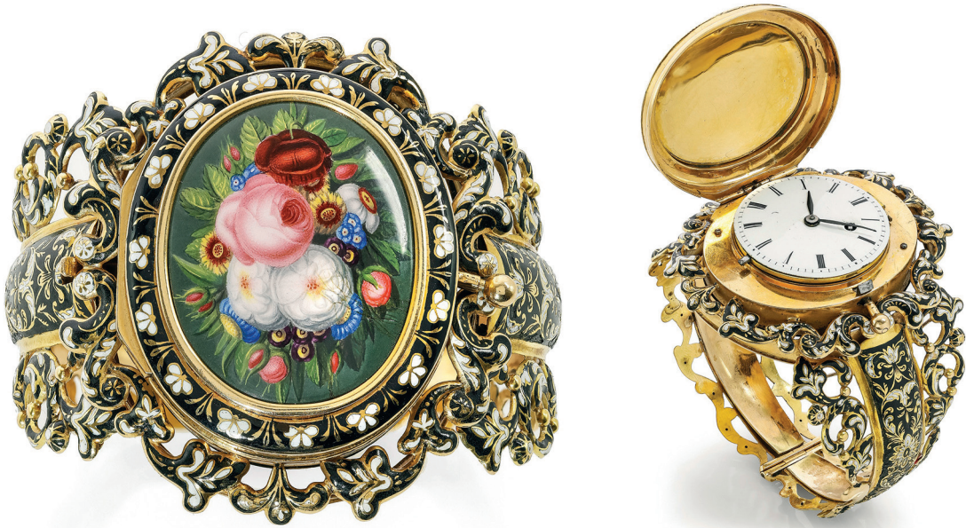
Gold and enamel bracelet with concealed watch (c.1830) by Moricand and Desgrange

9. Analyse the following elements of this jewellery design