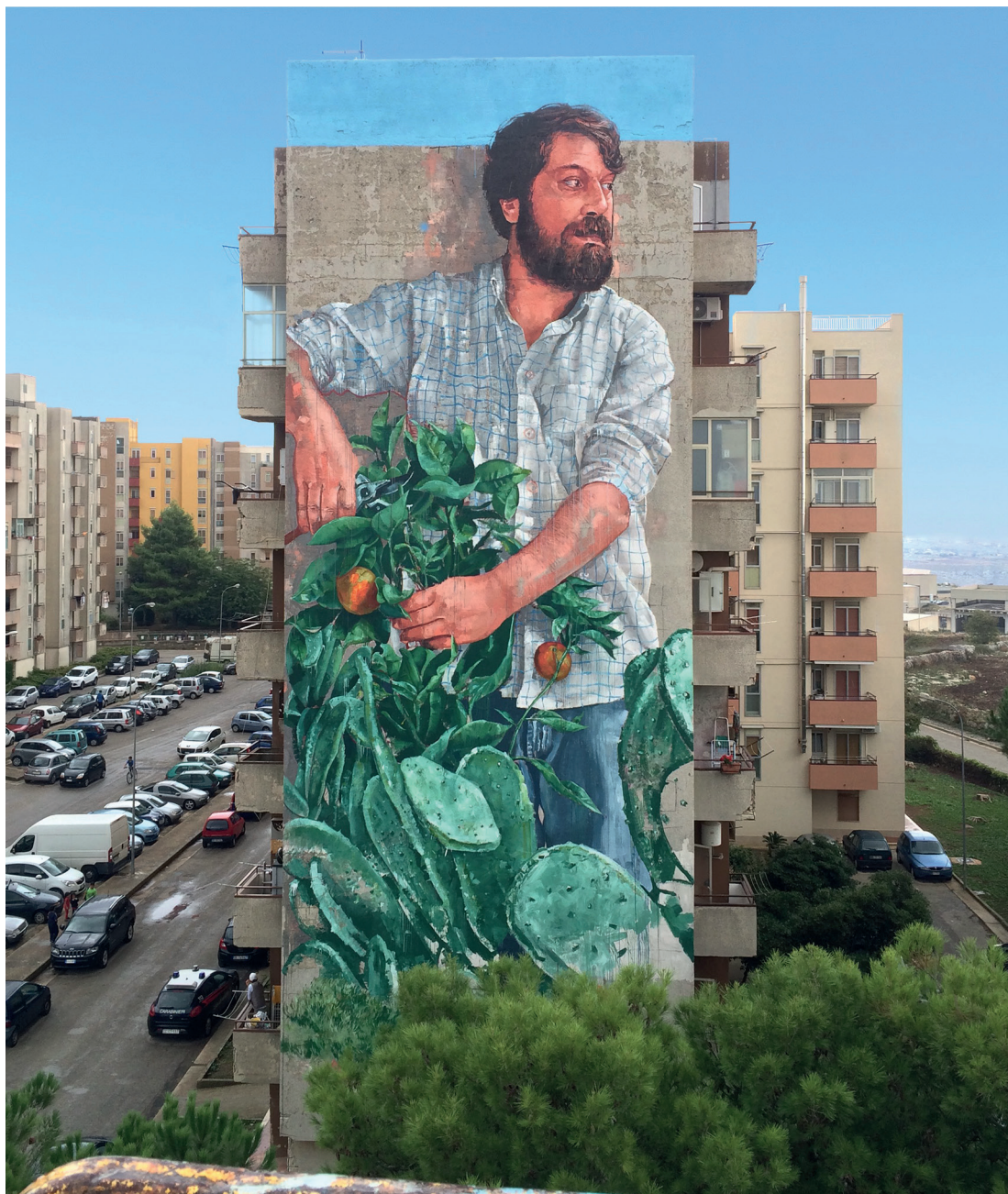
The Gardener (2016) by Fintan Magee Acrylic paint on concrete, Ragusa Italy

5. Analyse the following elements of this artwork