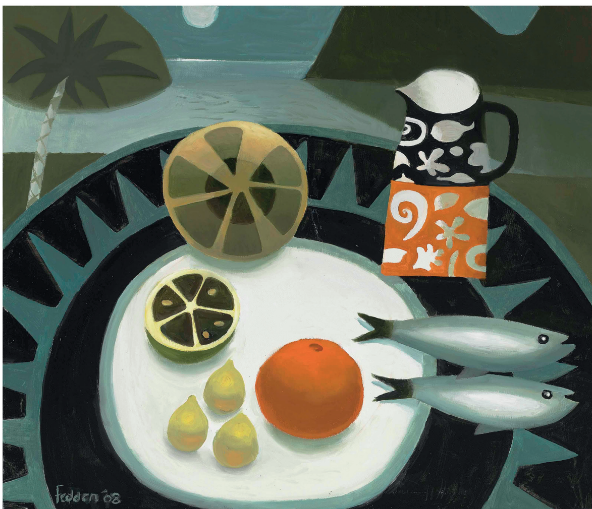
Charlotte's Jug (2008) by Mary Fedden