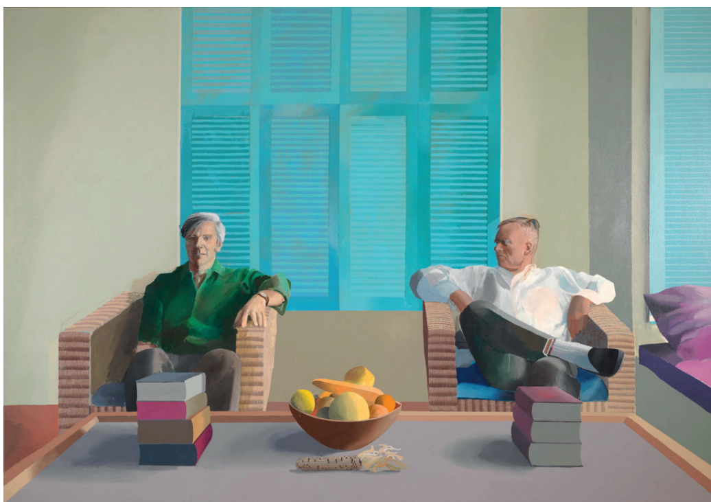
Christopher Isherwood and Don Bachardy (1968) by David Hockney