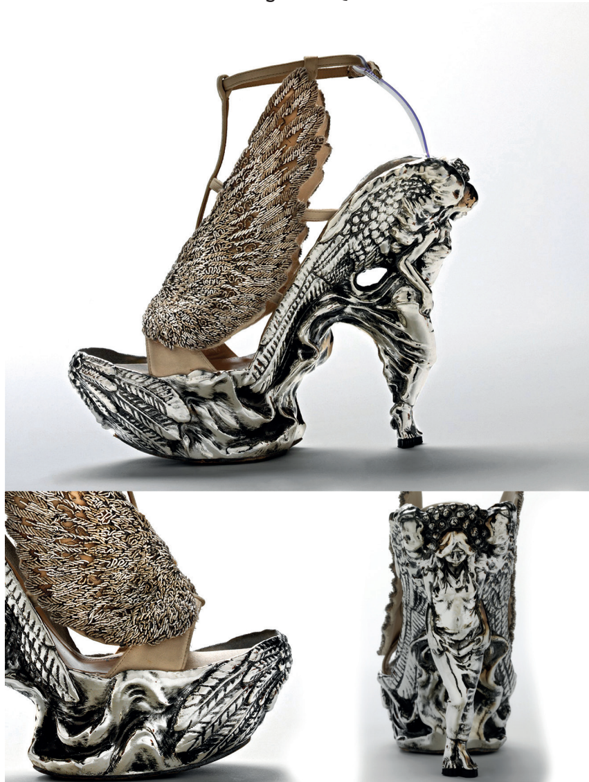
Angel Wing Shoes (2010) by Alexander McQueen

Materials: leather, resin 1 and silver thread