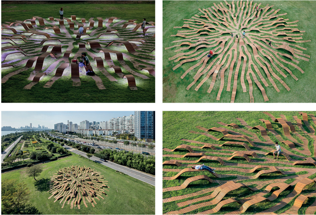
Root Bench by Yong Ju Lee (c. 2018)

Materials: metal frame and concrete footing with a wooden decking (diameter 30 m)