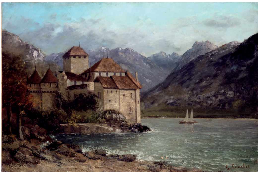
Le Château de Chillon (c. 1874–1875) by Gustave Courbet Oil on canvas (54 x 65 cm)

5. Analyse the following elements of this painting