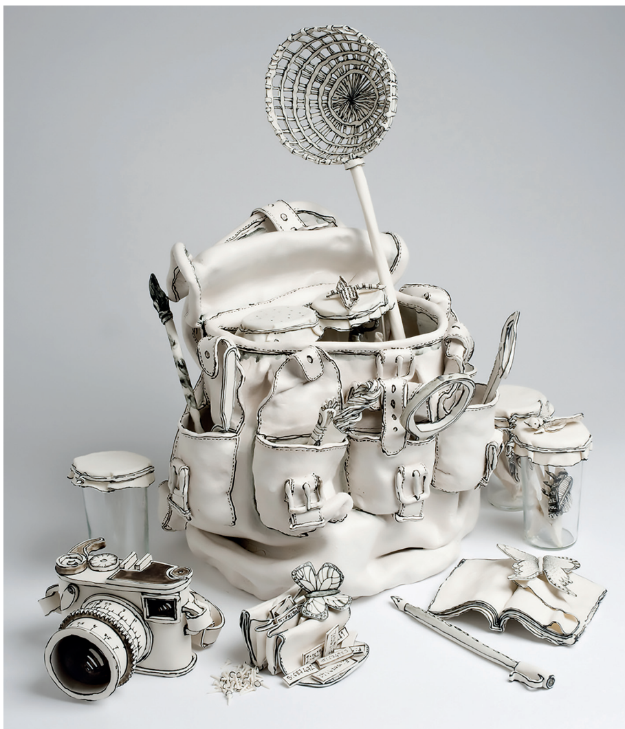
Rummage and Gather (2013) by Katharine Morling

Earthstone clay, white porcelain clay and black ink (60 x 40 x 30 cm)