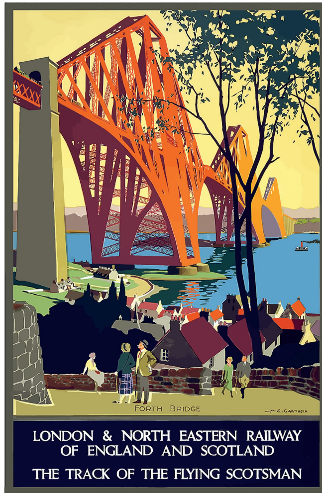
Forth Bridge Poster (c. 1930) by H G Gawthorn London and North Eastern Railway Advertisement

8. Analyse the following elements of this poster design