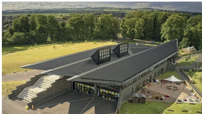
Broomlands Primary School, Kelso (2018) by Stellan-Brand

Materials: wood, glass, steel, locally sourced stone