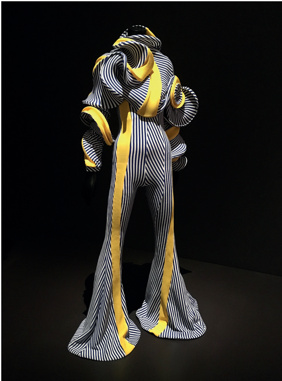
Jumpsuit (2017) by Richard Malone

Materials: recycled acrylic knit, plastic wire 1