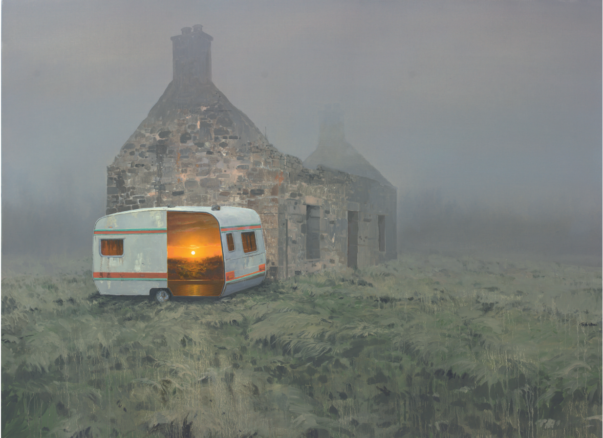
Merlin (2016) by Andrew McIntosh oil paint on linen (150 x 110 cm)

5. Analyse the following elements of this painting: