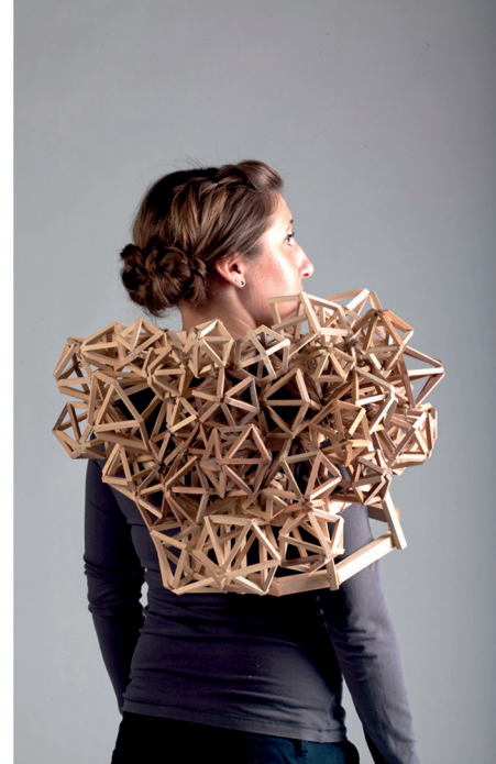
Wearable Structure: Tudor Collar (2011) by Tracy Featherstone