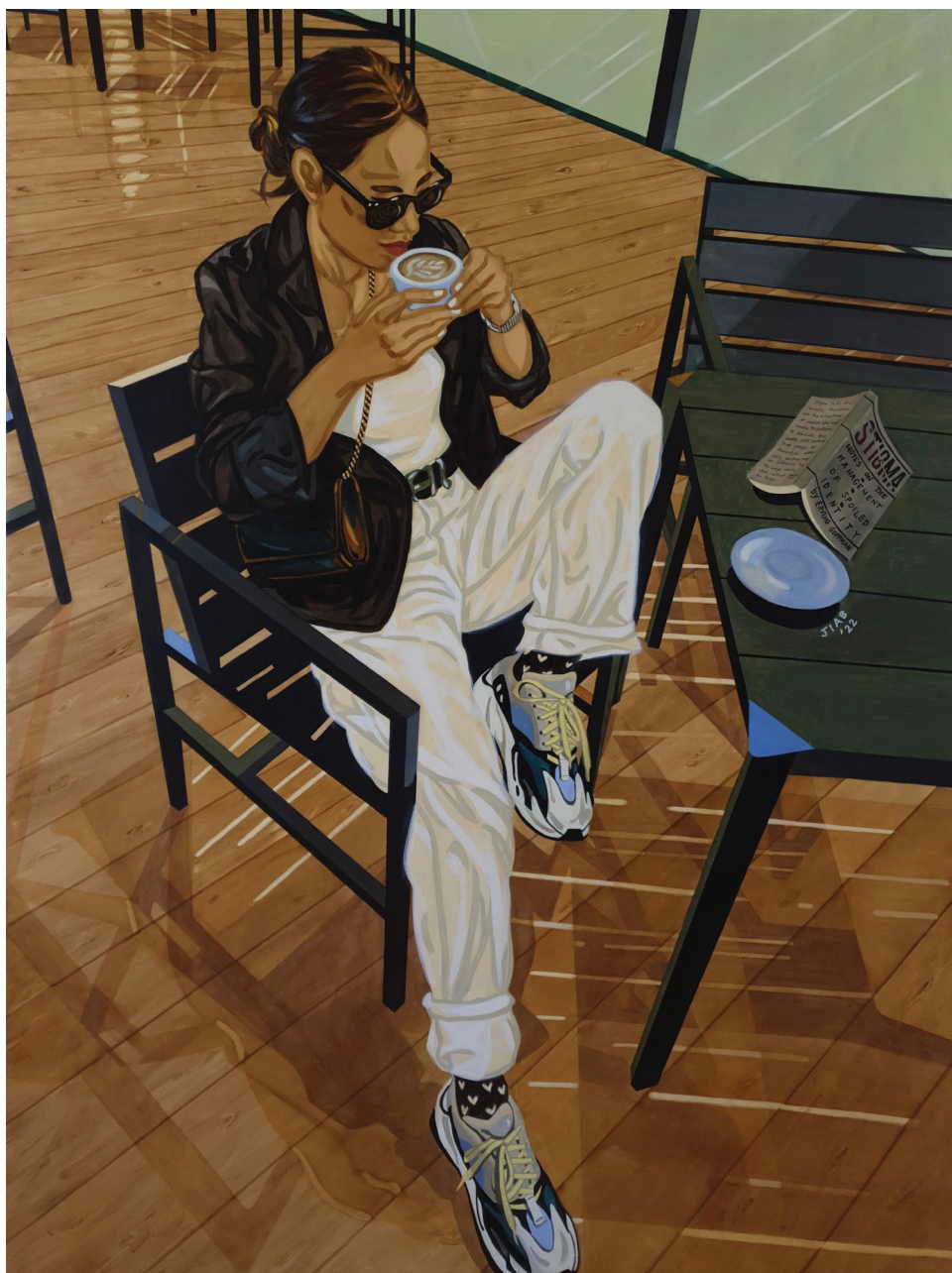
Young Sister (2022) by Jiab Prachakul acrylic on linen (160 × 120 cm)

2. Analyse the following elements of this painting: