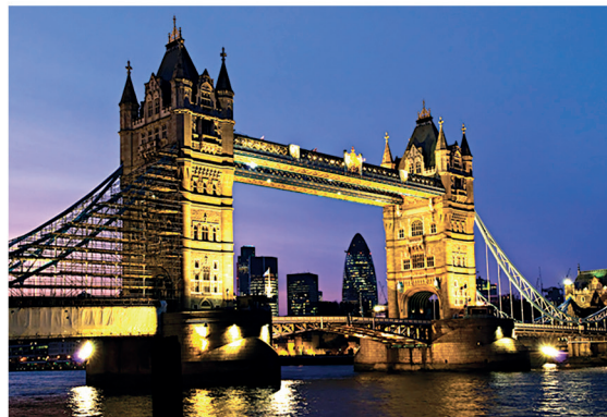
Tower Bridge, London (1884) by Sir Horace Jones