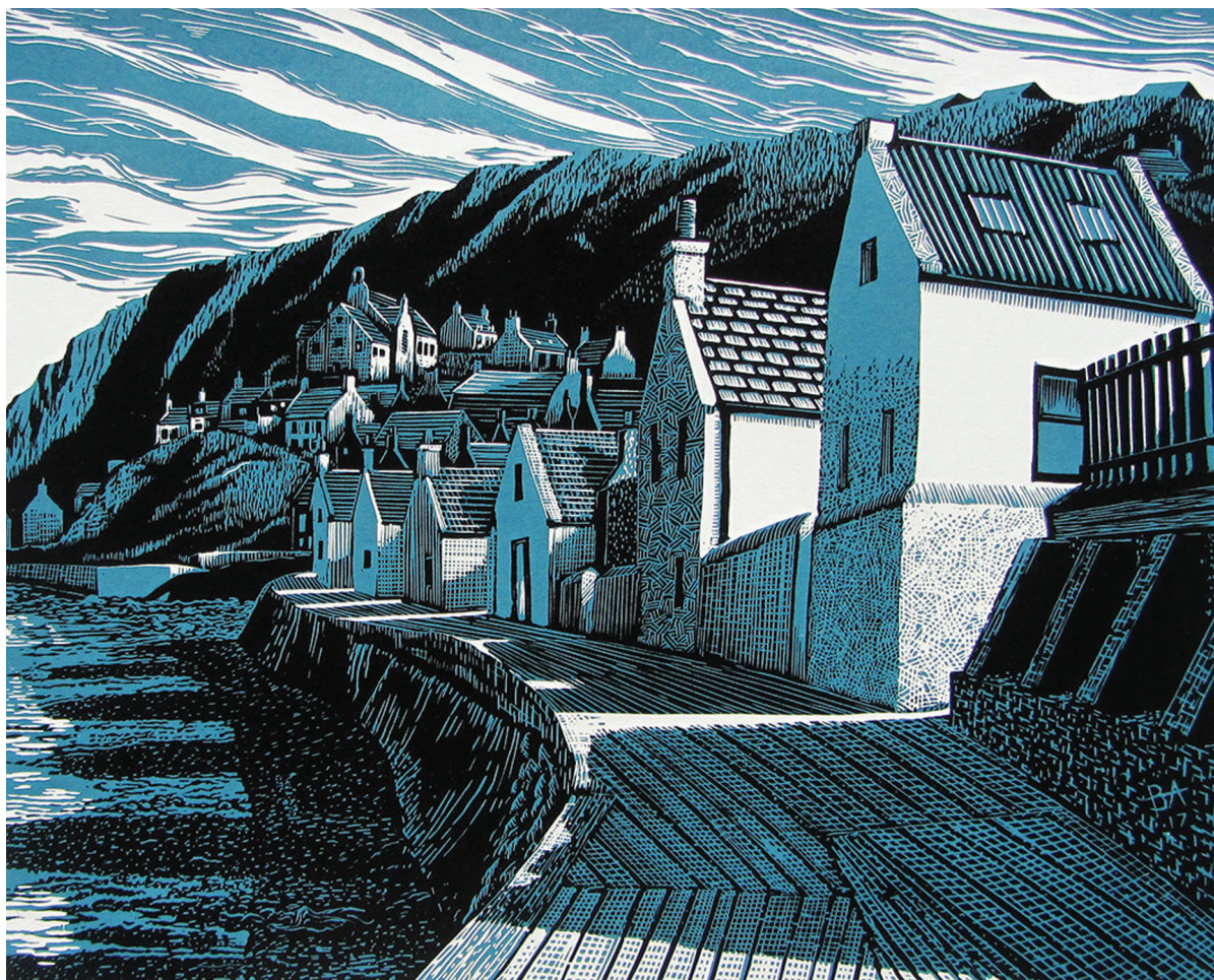
Gamrie Sunday (2017) by Bryan Angus two colour linocut printed on paper (25 × 31 cm)

6. Analyse the following elements of this artwork: