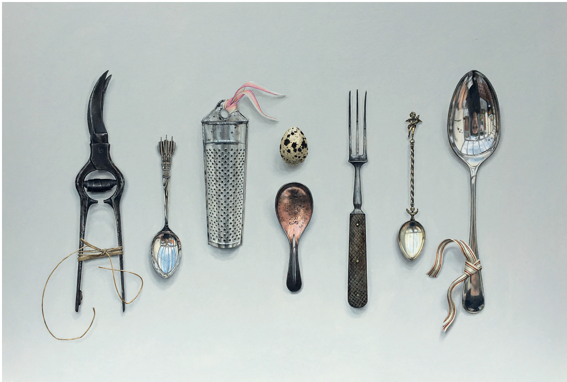
Kitchenalia (2019) by Rachel Ross acrylic paint on panel (54 × 80 cm)

3. Analyse the following elements of this painting: