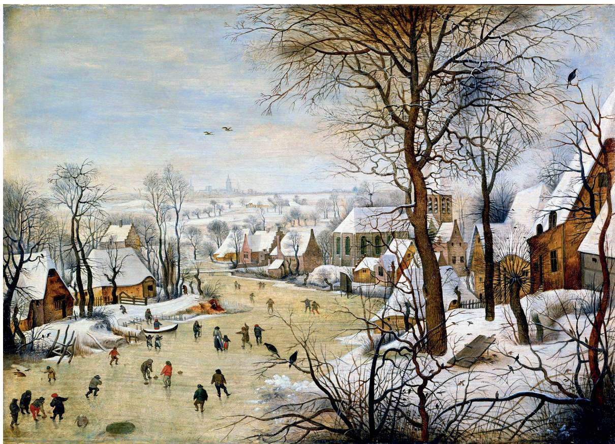
Winter Landscape with Skaters and Bird Trap (1565) by Pieter Bruegel the Elder oil paint on panel (37 × 56 cm)

5. Analyse the following elements of this painting: