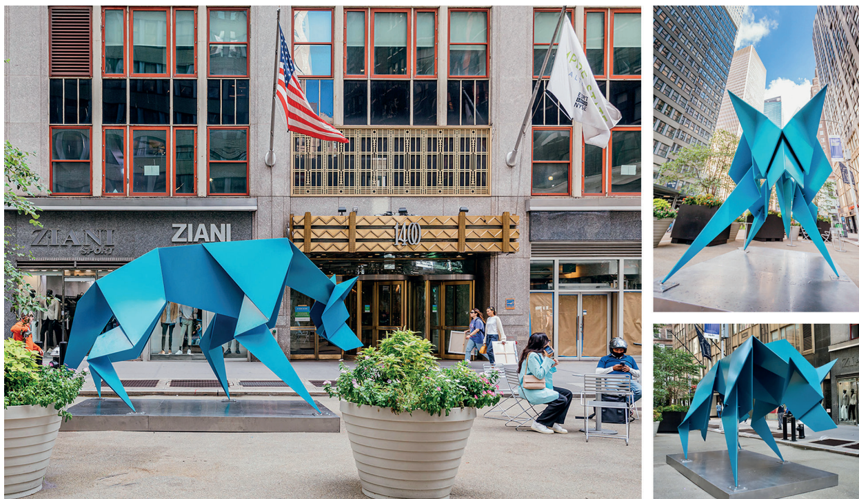
Coyote, Stalking (2015) by Gerardo Hacer weatherproof, colour coated steel (248 × 198 × 447 cm)

4. Analyse the following elements of this sculpture: