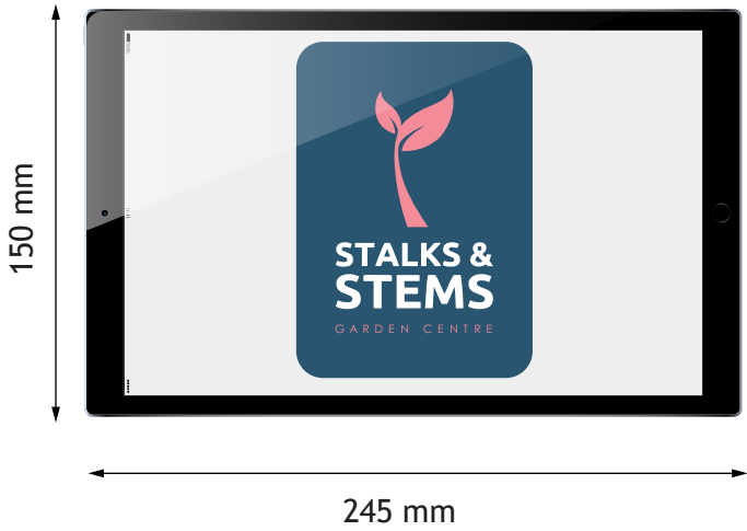
Tablet size — 8 mm thick

The specification should include key points from the brief and research to detail the requirements of the proposal. It should clarify aspects such as aesthetics, function, ergonomics, performance, and cost.