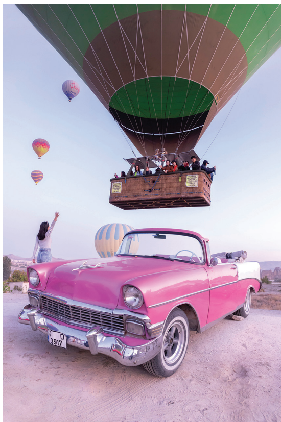
Cappadocia, Turkey (2019)

Refer to this image on the supplementary sheet when answering question 12.