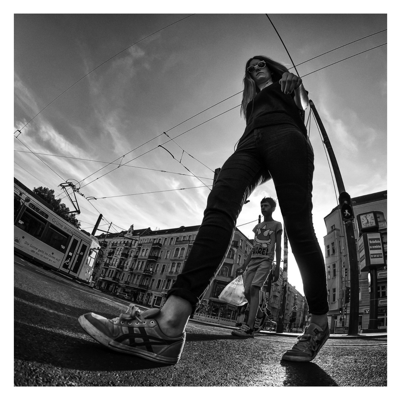
Repetition (2015) by Willem Jonkers